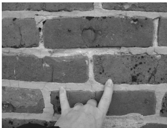
Fig. 1. Image of an historic brick masonry wall that has had a new mortar smeared over the existing original instead of being raked out and repointed properly. Preliminary field assessment by an experienced preservation professional is essential for defining a mortar-analysis program. An inexperienced preservation professional might mistake this construction as having different pointing and setting mortars. All illustrations by the author.

Identifying the information needed from a mortar analysis is the first and most important step in obtaining the right services. The analytical objectives will determine not only the analysis method(s) to be used but also the size and number of samples that will be required and the most appropriate individual to perform the analysis. Because of the costs associated with any kind of materials analysis, the architectural conservator, architect, engineer, or other preservation professional in charge should establish the need for mortar analysis and define the analytical objectives at the earliest possible point in a project, preferably before any